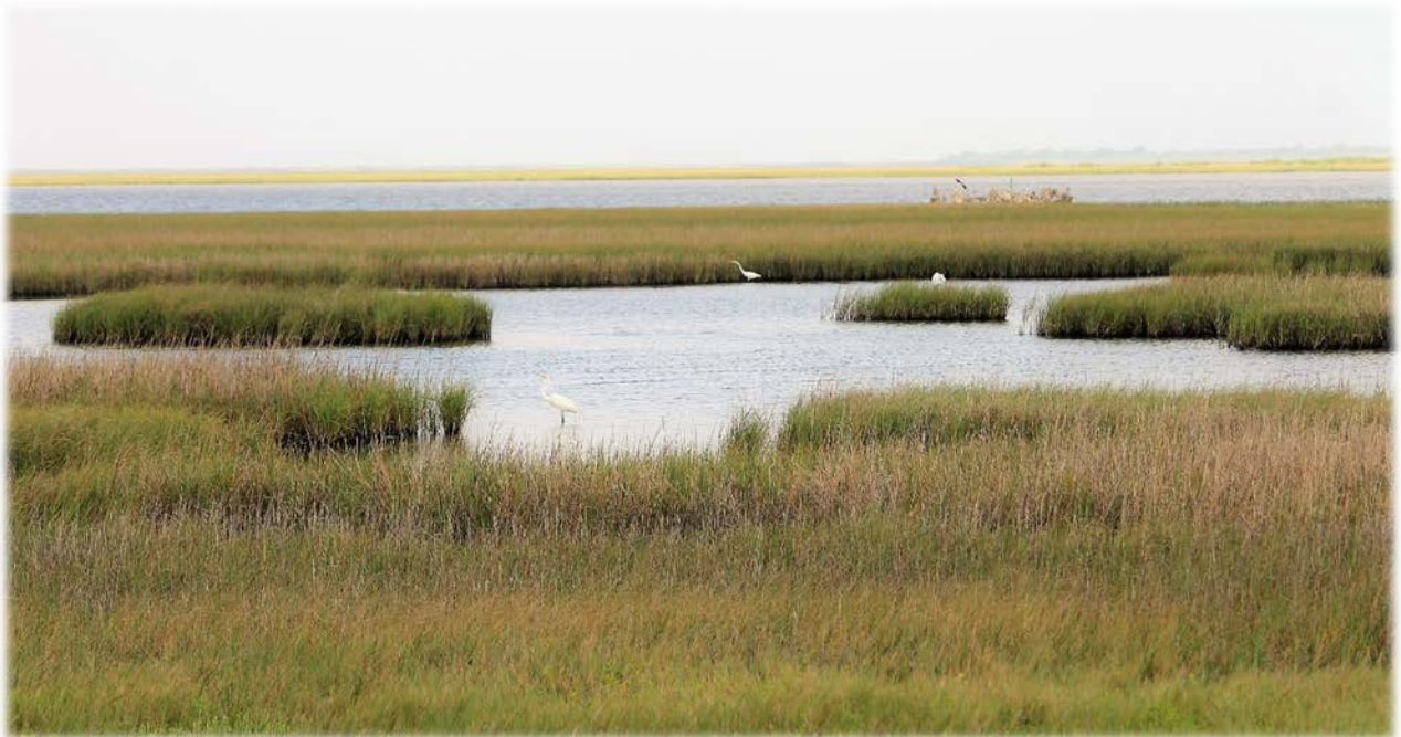
Chocolate Bay Preserve shoreline along coastal waterway