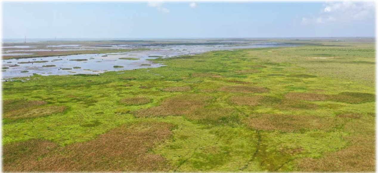
Freshwater and Brackish Marsh Complex at Chocolate Bay Preserve